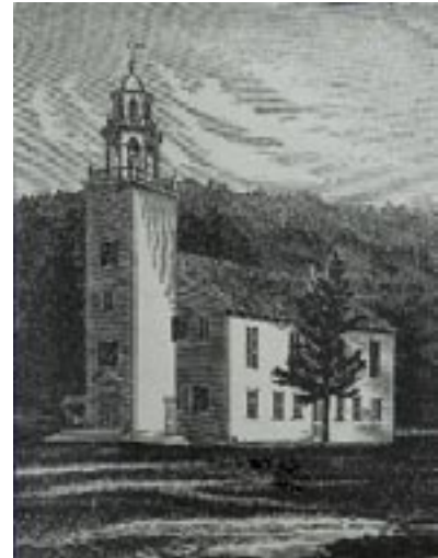
The original Universalist Church of Winchester